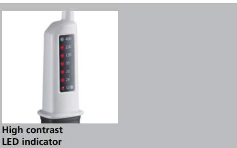
High contrast LED indicator