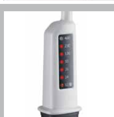
High contrast LED indicator