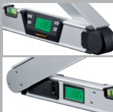
LC display on the front and rear side