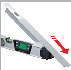
Bevel extended downward ....