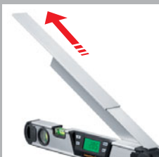
.... or upward, as needed.