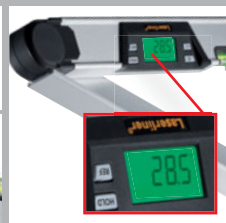
Display flips 180° at the touch of a button