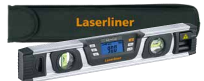
DigiLevel Laser G40 inclusive softbag + Batteries