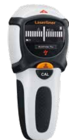
MultiFinder Plus + battery Packing dimension (W x H x D) 190 x 310 x 80 mm