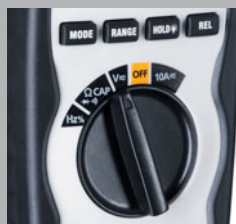
Easy-to-use function knob