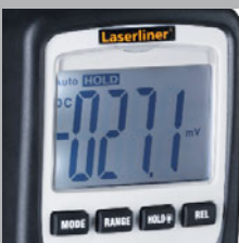
Large, illuminated display