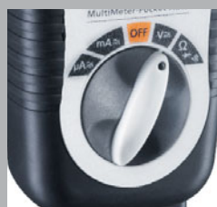
Easy-to-use rotary function knob