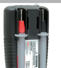
Test prod holder