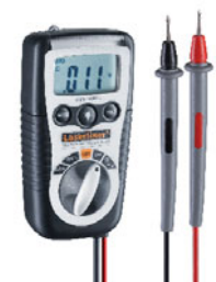
MultiMeter-Pocket + batteries (2x 1.5V AAA)

Packing dimension (B x H x D) 110 x 235 x 70 mm