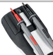
Test prod holder