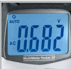
Large LCD display with background lighting