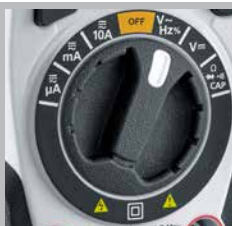
Easy-to-use rotary function knob