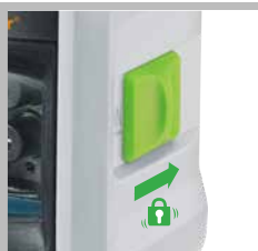
Pendulum can be locked for protection during transport