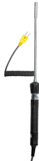
ThermoSensor Air + spiral cable

Packing dimension (W x H x D) 90 x 400 x 30 mm