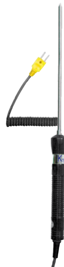
ThermoSensor Tip + spiral cable

Packing dimension (W x H x D) 90 x 400 x 30 mm