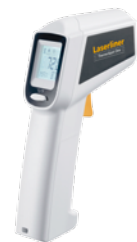
ThermoSpot One + batteries