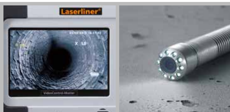
5.0" TFT colour display